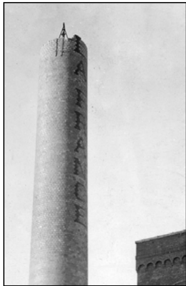
The powerhouse, the smokestack with "LaFrance" built into the brick pattern (left) and the water tower were landmarks visible from Bloomfield Avenue for many years. The water tower was demolished long ago. The smoke stack was demolished several years ago. The power house is still standing.