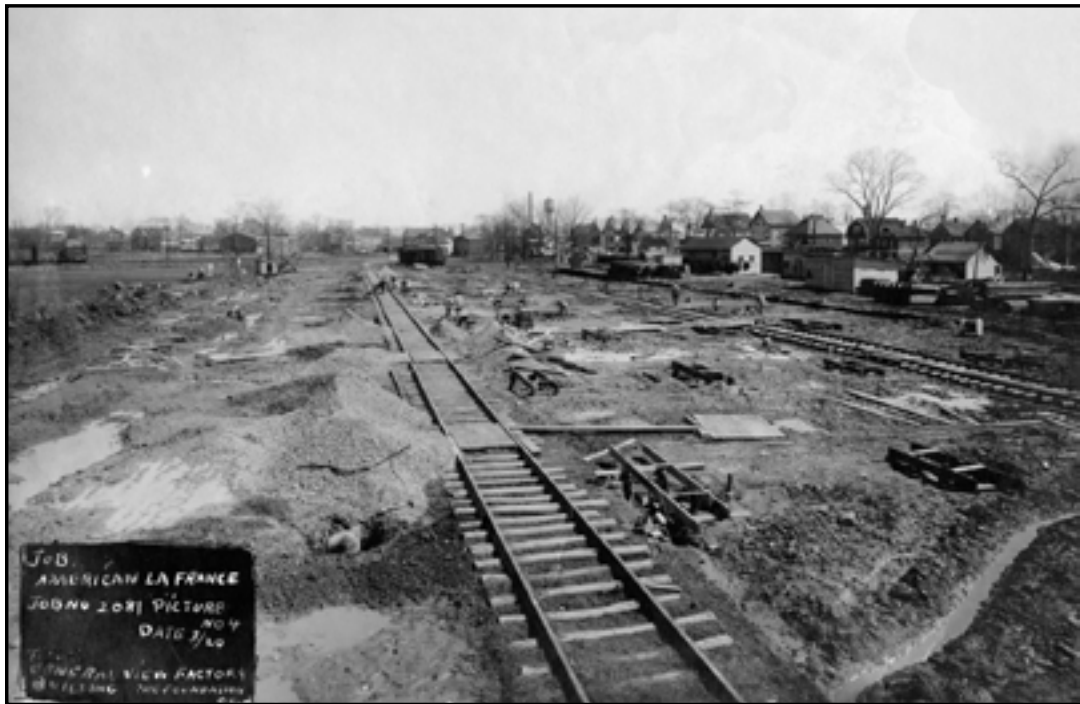
The first order of business was building railroad sidings. One of the main reasons American LaFrance chose this location was because of its proximity to a railroad.